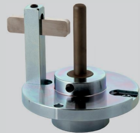
External skiving tool

For efficient skiving of hydraulic hoses (external and internal) from dimensions 3/16" to 2". The machine is easily controlled by a footpedal. With a bin for rubber waste.